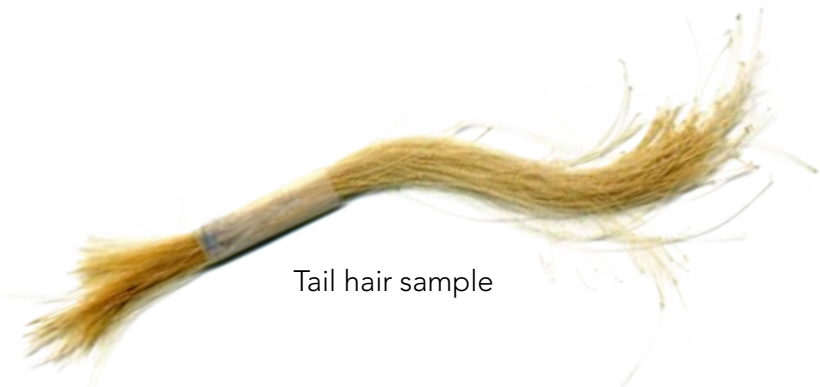
Tail hair sample