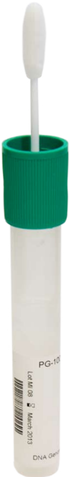
Nasal swab kit