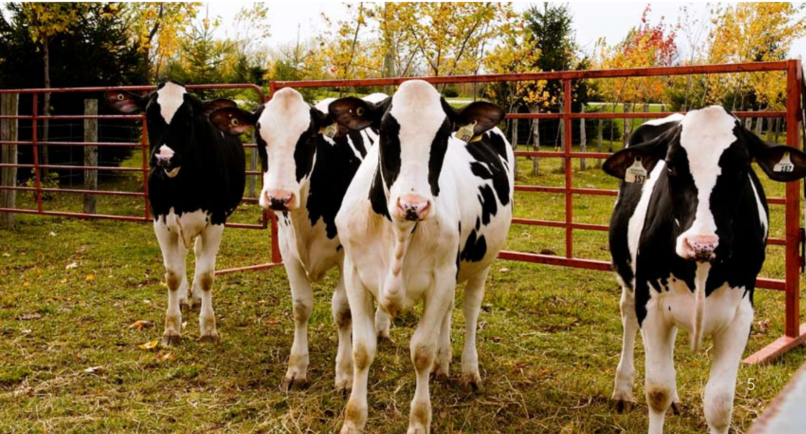
Table 2 estimates the net economic benefit of using genomics to select replacement heifers. Two main factors affecting the benefits include the number of heifers available and the number selected for replacement.

Genomics provides a much more accurate tool for selecting heifers thus increasing the rate of genetic progress. Lifetime Profit Index (LPI) provides an overall measure of the economic value an animal will contribute and considers factors such as, production, durability, health, and fertility. Using genomics to select heifers will increase the rate of LPI progress made versus traditional selection methods.