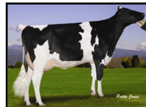
Ubyssy Stanleycup Endora, VG85-2Y UBC Dairy Education & Research Centre, Agassiz, BC