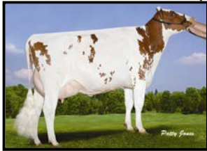
KNI054 Spectrum Ember, GP80 Knillstead Farm Ltd., Princeton, ON