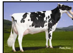
Schurstar Admiral Dakota, NC Schurstar Dairy inc., Abbotsford, BC