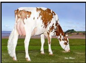
Forever Schoon Hope 2, NC 2-6 305 7492 kg 4.0% 3.5% (242-233-257) proj. Forever Schoon Farm, Vernon Bridge, PEI