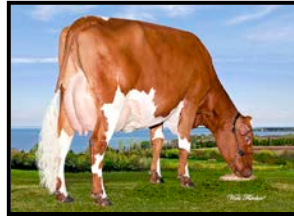
Des 3J Roni, GP83-2Y 2-1 305 6815 kg 4.7% 3.5% (224-253-240) proj. Ferme Laitière 3J inc., Saint-Félicien, QC