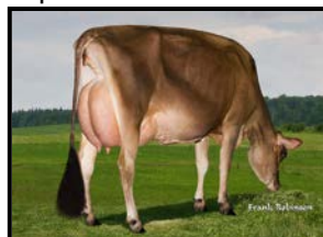
Missiska I Pod Nepal, VG87-2Y Ferme Jacquard, Saint-Henri, QC