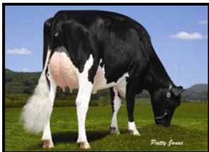
Vyecroft Dellia Lavanguard, VG85-2Y 2-4 305 9930 kg 4.3% 3.1% (244-280-236) proj. Vyecroft Holstein Farms, Rosedale, BC