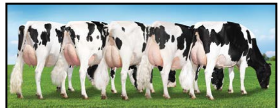
5 Admiral daughters